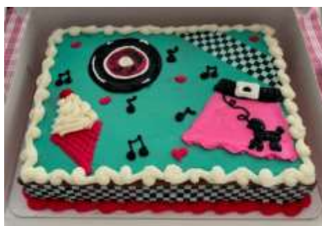
18 Best Sock Hop Cake Ever!