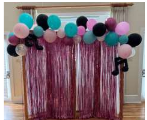
20 Sock Hop Step & Repeat