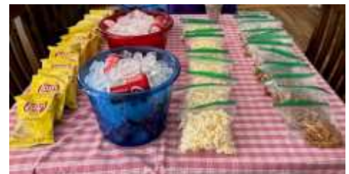
21 Wonderful Snack Table