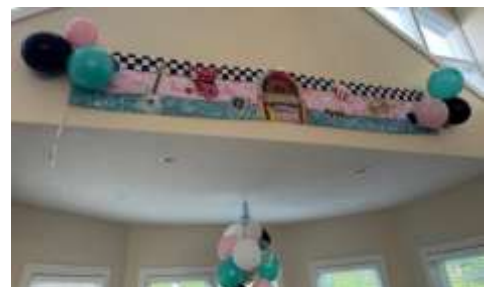
22 Decorating for the '50'